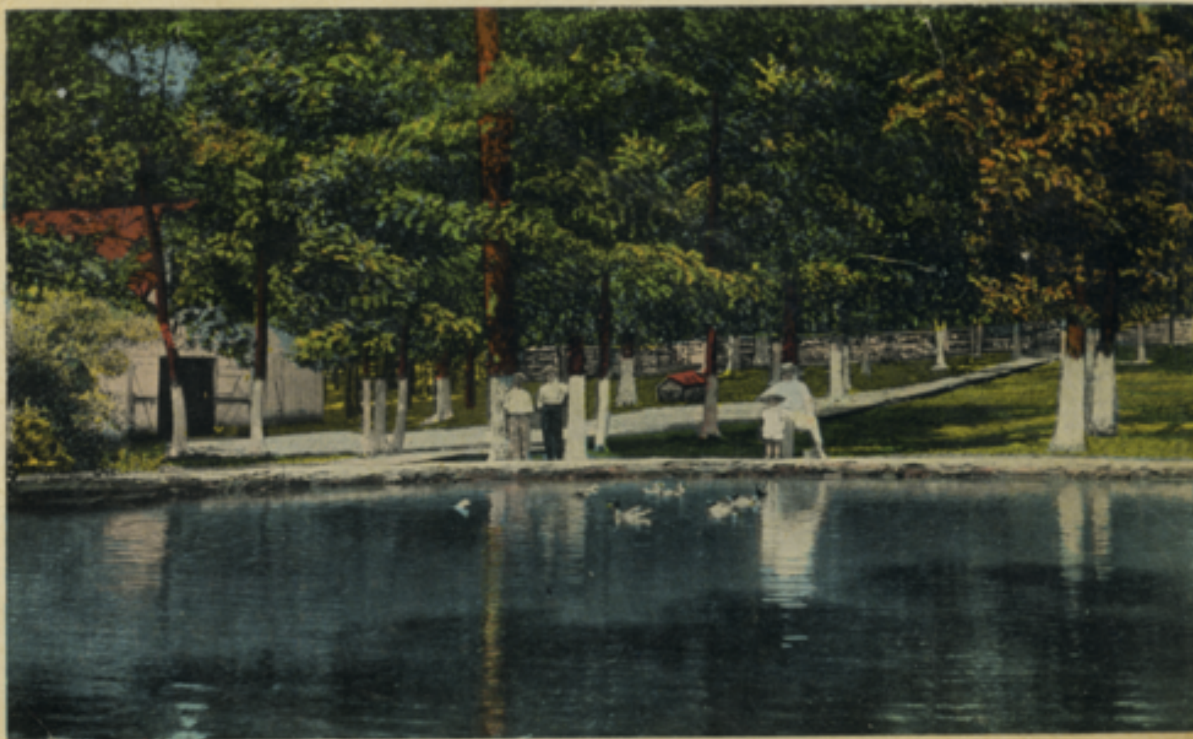
Hot Springs National Park, Ark.