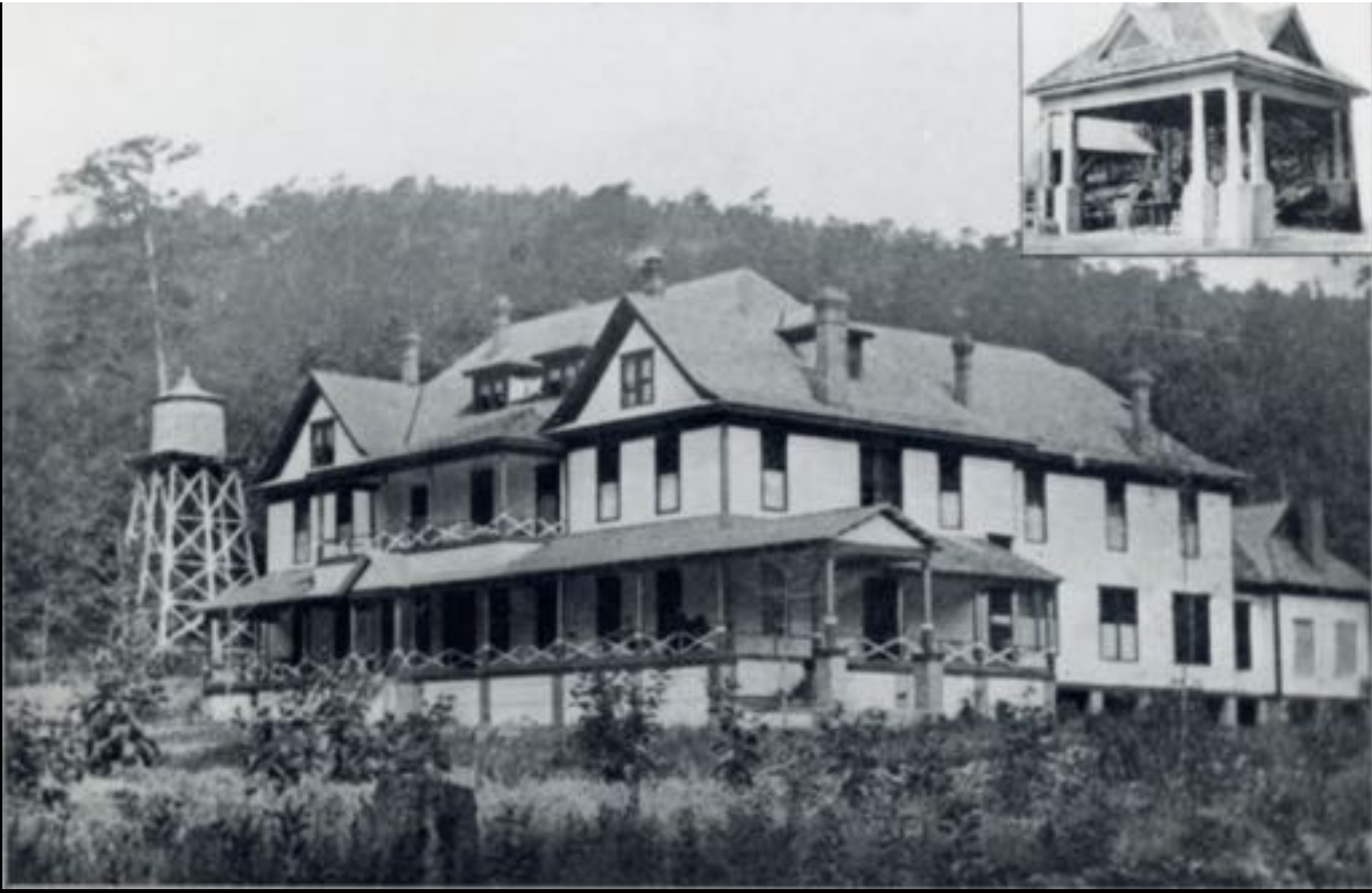
Mountain Valley Hotel, 1921