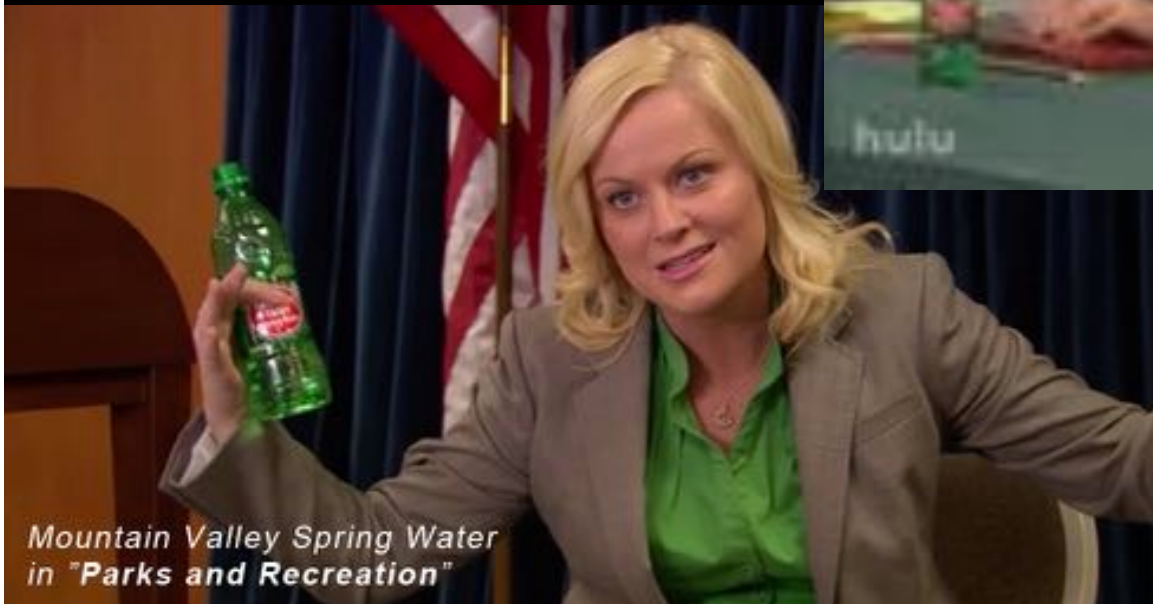
Mountain Valley Spring Water in "Parks and Recreation"