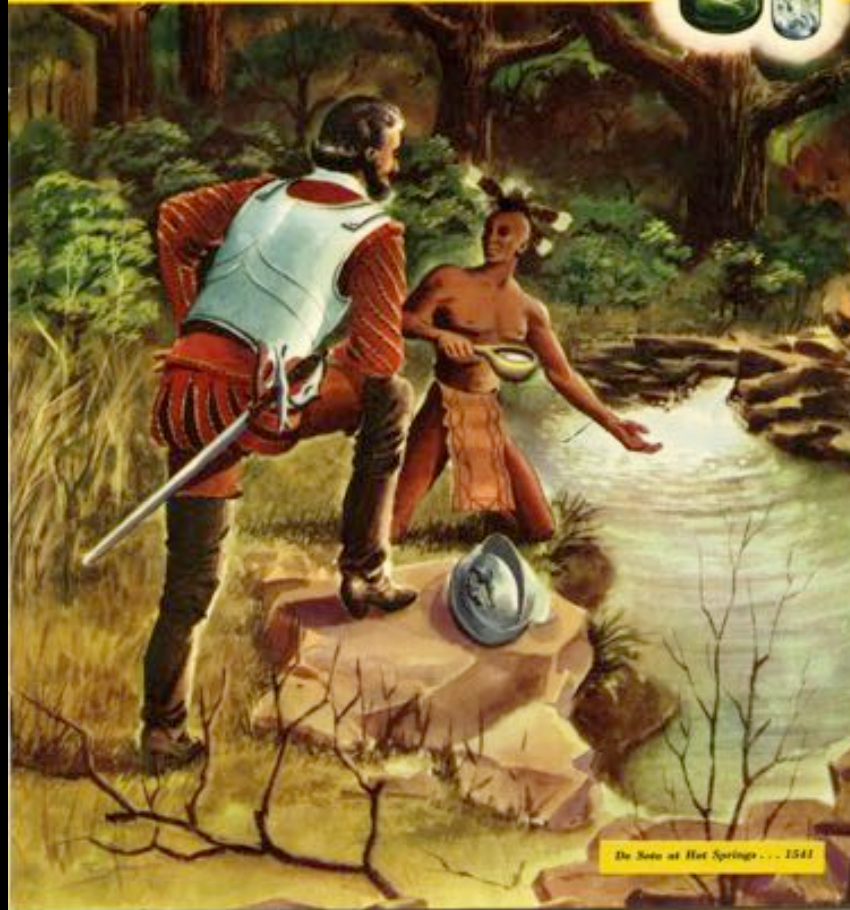
De Soto at Hot Springs . . . 1541